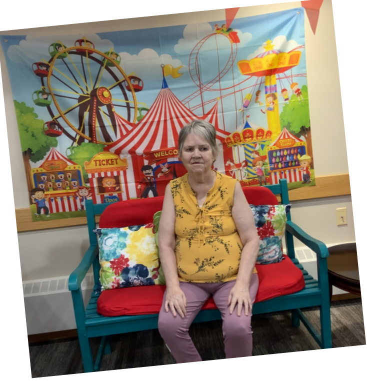
"LIFE IS a Fair adventure, enjoy the ride!"

"A Fair is an enchanted place where dreams come to life"